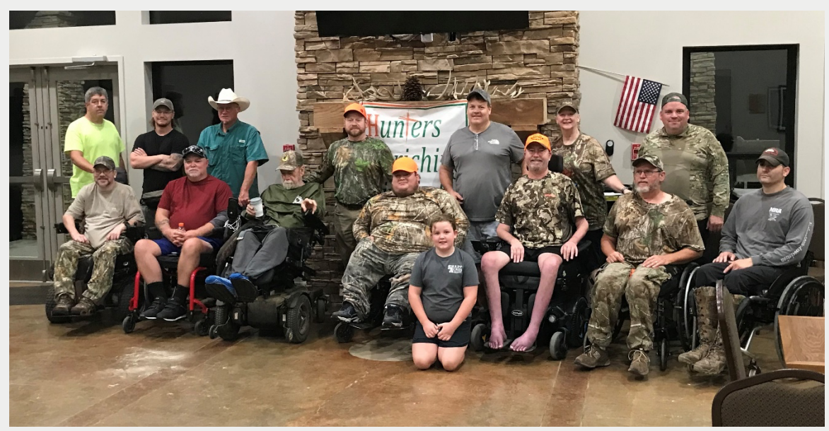
Chesapeake helped sponsor a hunt hosted by Sabine Parish HELP (Helping Enrich Lives of People), which gives people with physical exceptionalities and veterans the opportunity to enjoy hunting and the outdoors.