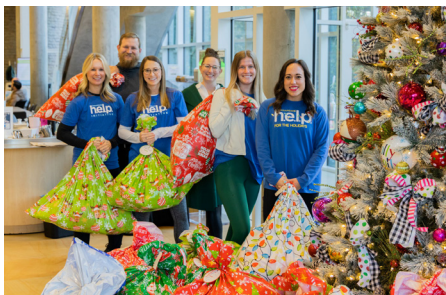
Oklahoma City employees donated 581 pairs of pajamas for students and teachers at Martin Luther King Jr. Elementary and gift items to Socks for Seniors.

Additionally, the Haynesville office donated $10,000 to the Red River Restoration Center to support its annual holiday giveaway event. The event is open to the community and offers gifts for children, a special holiday lunch and free services, such as haircuts and manicures.