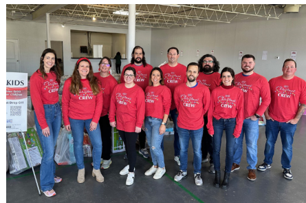
Operations teams in Oklahoma City donated toys and volunteered to sort and organize wish-list items for Joy4Kids, a program providing gifts for foster children through Citizens Caring for Children.